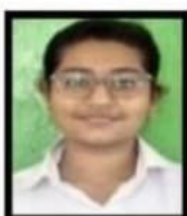
SIDRA AMBER 96.6%