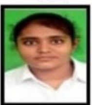
JHHILLSHREE GAVEL 90.6%